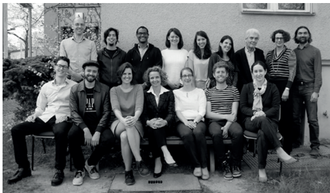
THE FACULTY AND STAFF OF THE HISTORY DEPARTMENT