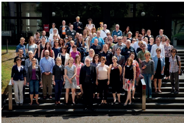
PARTICIPANTS OF THE FINAL POPULAR SERIALITY CONFERENCE